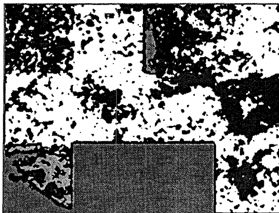
Figure 2: Classification of Tapajós site using MLP

on Systems, Man and Cybernetics , Vol 3 , No. 6, pp. 610-621, Nov. 1973.