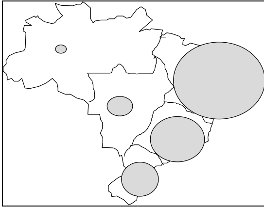
Figure 2 - Result of combination of query results.

We may also be interested in showing this data by means of a bar chart: